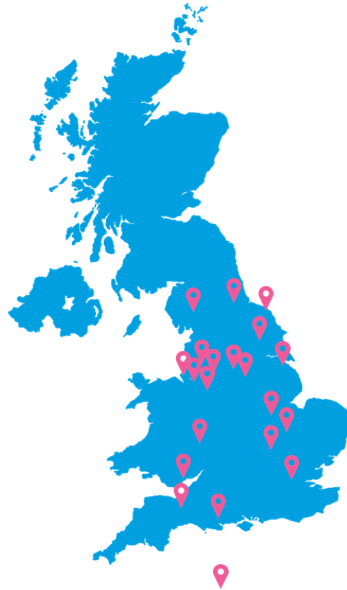
Location of the areas for the survivor survey responses

8% were experiencing abuse at the time of responding and 92% had previously experienced abuse